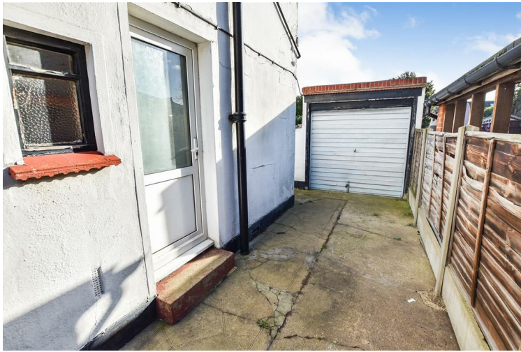
Detached single garage with up and over door.