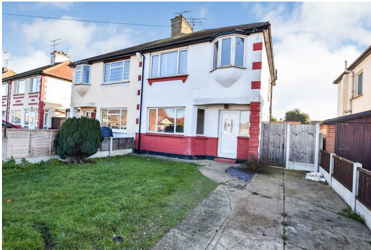
Walled frontage, hard standing driveway proving off street parking with potential to create additional parking where currently lawned.